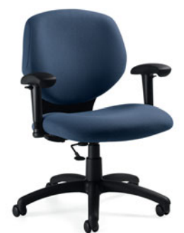
2358-6 - Medium Back Task with arms