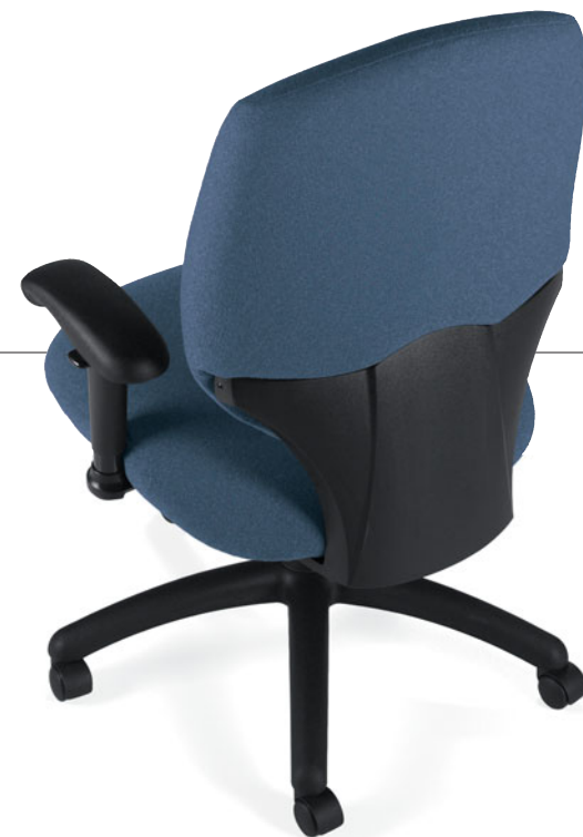
2356-3 - High Back Multi-Tilter