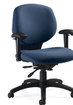
2357-3 - Medium Back Multi-Tilter