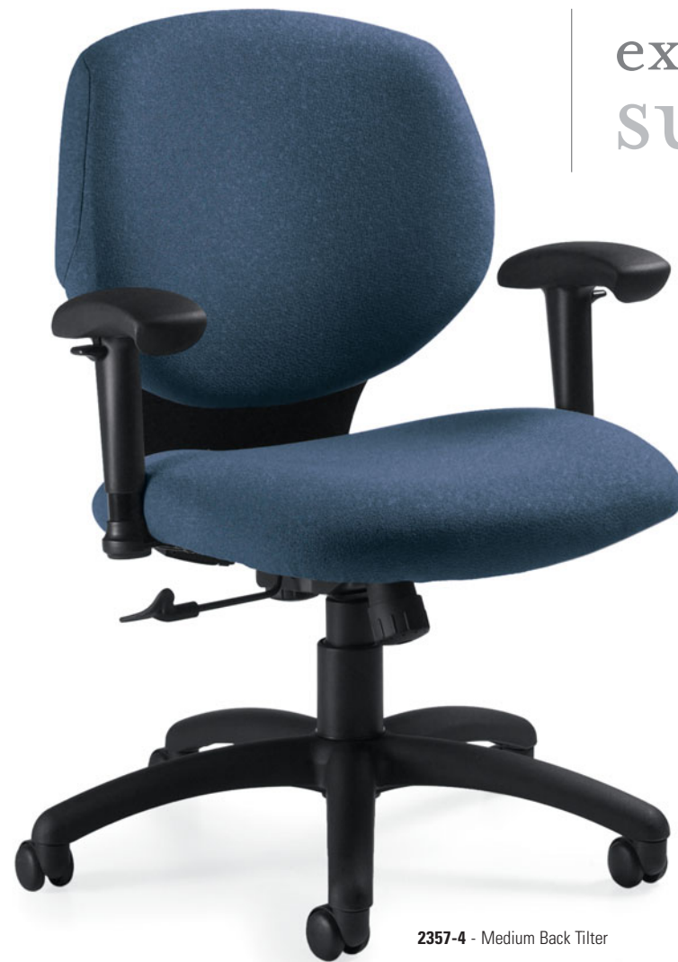
2357-4 - Medium Back Tilter

Designed by leading chair designer Zoey Chu, this series offers exciting performance, appearance and value.