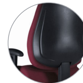
Back Shroud - A protective outside back shroud offers increased durability.