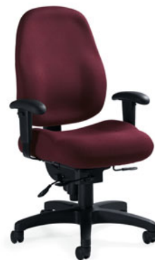
2432-16 (TD) - High Back Synchro-Tilter with TD arms, and seat slider