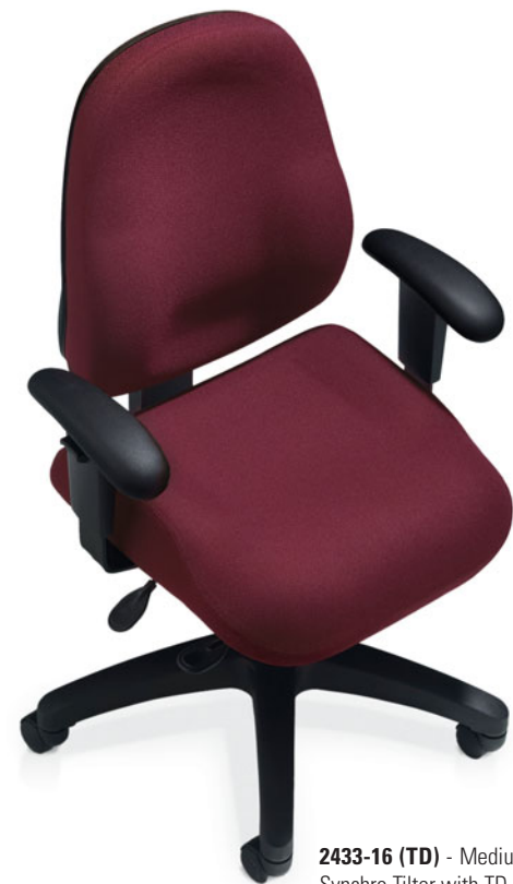
2433-16 (TD) - Medium Back Synchro Tilter with TD arms

This state-of-the-art multi-shift, intensive use seating is designed with a wide range of adjustment possibilities. Rated at a 350lb. weight capacity and featuring a high-density molded seat and back foam, Dexter and Dexter Plus models accommodate users who prefer extra room and long lasting comfort. Select from the multiple adjustments to make your chair fit and support you perfectly throughout your workday.