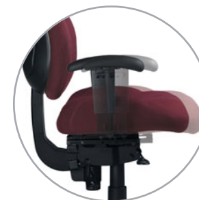
Seat Slider - Offers a 2" adjustment to accommodate tall and short users.