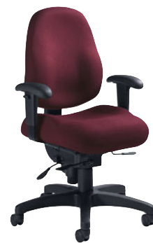
2433-16 (TD) - Medium Back Synchro-Tilter with TD arms and seat slider.