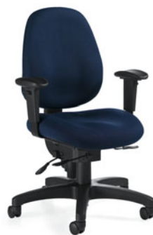
2437-1 - Medium Back Synchro-Tilter with 3M arms and seat slider.