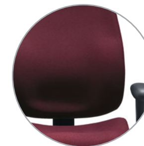
Lumbar Support - is height adjustable and can be positioned to provide the right fit and comfort.