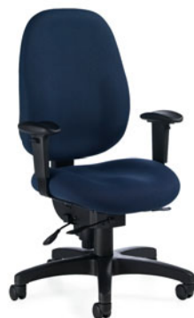
2436-1 - High Back Synchro-tilter with 3M arms and seat slider.