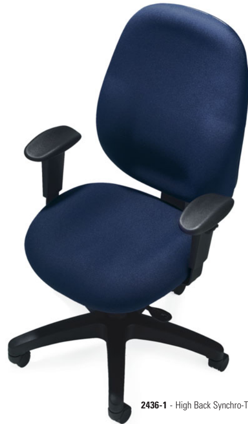
2436-1 - High Back Synchro-Tilter