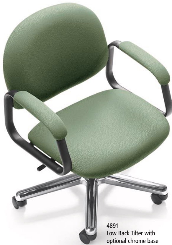
4891 Low Back Tilter with optional chrome base

Alto features oval tube frames with contoured seats and backs and either urethane or upholstered armcaps. Chairs are equipped with a five-legged, injection molded base made from durable fiberglass filled nylon. • Upholstered back shroud standard on high back models • Plastic back shroud standard on low back models