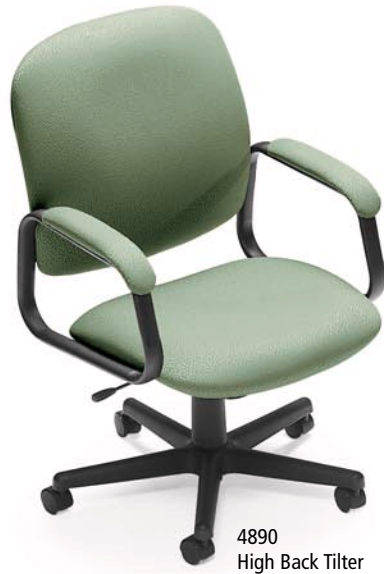
4890 High Back Tilter