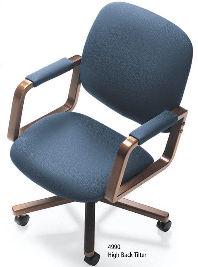
4990 High Back Tilter

Alto Wood features a contoured seat and back with upholstered armrests. Arms are molded hardwood veneer. Five-legged steel base with hardwood capping. • High Back, Low Back and armchair models available