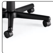
Five-legged injection molded base