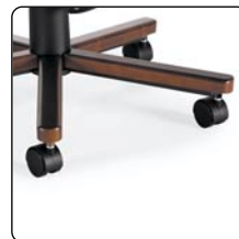
Five-legged wood capped steel base