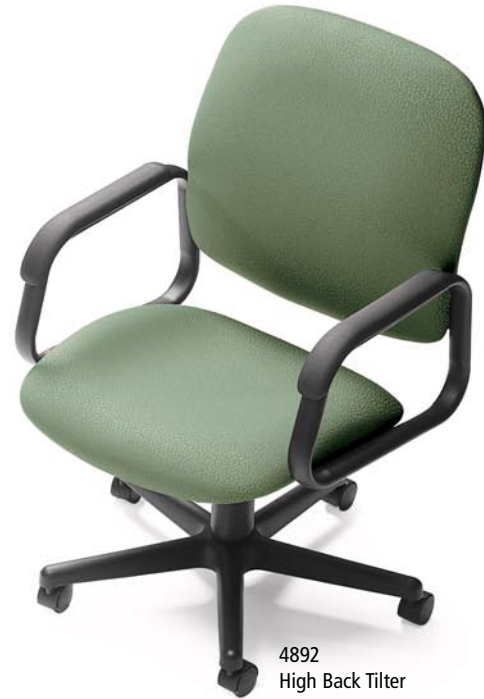
4892 High Back Tilter