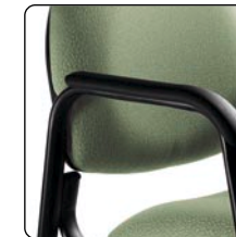
Self-skinned urethane armcaps (black only)