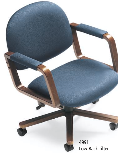
4991 Low Back Tilter