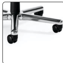
Optional Five-legged chrome base