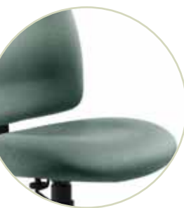
Contoured seat – All Granada models feature contoured seats with waterfall edges.