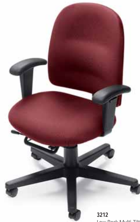
3212 Low Back Multi-Tilter