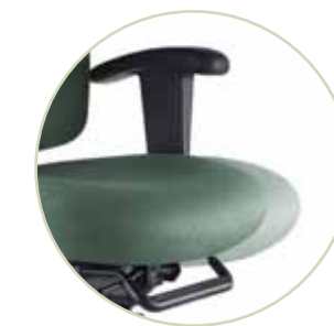
Seat slider (MD) – Adjustable seat depth is standard on multi-tilter models allowing the users to change the seat depth to accommodate the length of their thighs.