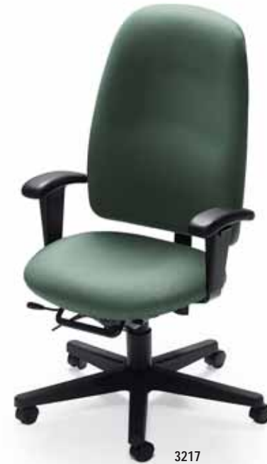
3217 High Back Multi-Tilter