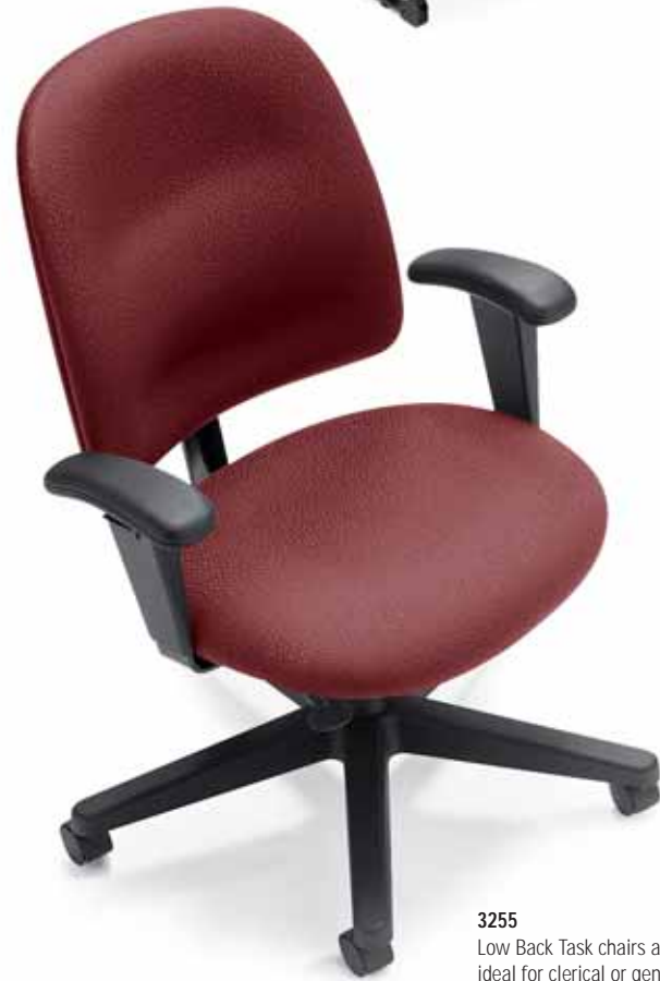
3255 Low Back Task chairs are ideal for clerical or general office applications.