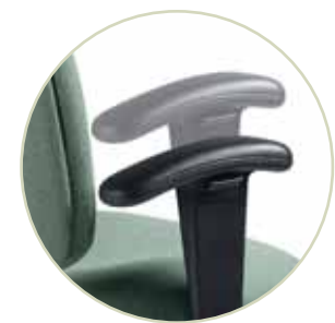
Height adjustable arms – are standard on all Granada chairs with "T" arms.