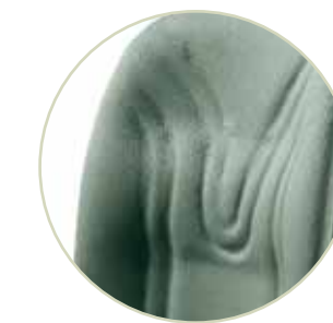
Stitching – Detailed back stitching is available on some models.