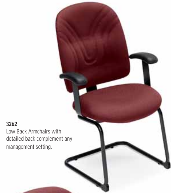
3262 Low Back Armchairs with detailed back complement any management setting.